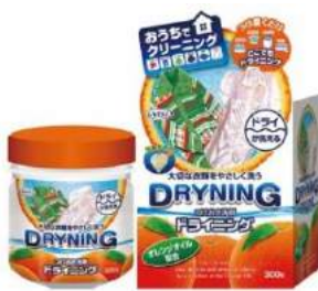
Gel type 300g Comes with a measuring spoon and washing guidebook