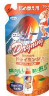
Refill Net size 450mL