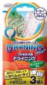
Gel type Single use pack Net size 5g x 3 packs