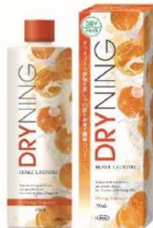
Net size 300mL Comes with a washing guidebook