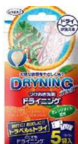
Gel type Single use pack Net size 5g x 5 packs