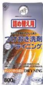
Refill pack Net size 800g