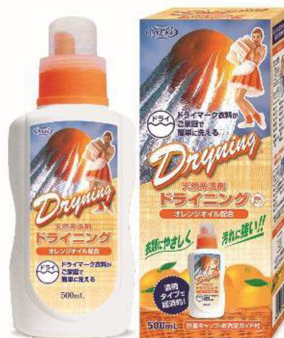
Liquid type Net size 500mL Comes with a measuring cap and washing guidebook