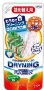
Refill pack Net size 270g