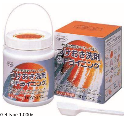
Gel type 1,000g Comes with a measuring spoon and washing guidebook

Liquid type with enzyme for high solubility in the washer